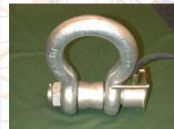
Shackles to 500 tonne